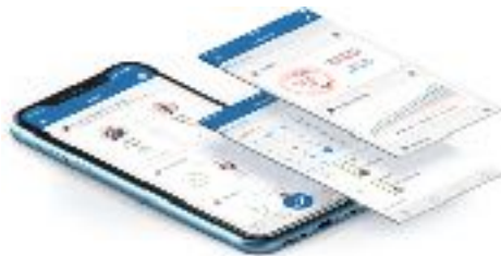
Mobile with built-in AI