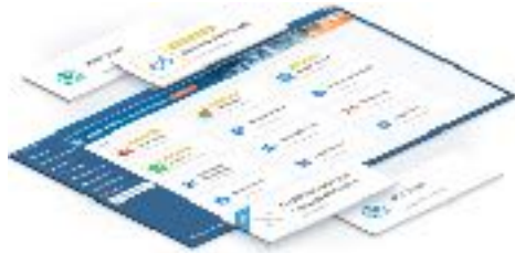
Simple, non-tech admin