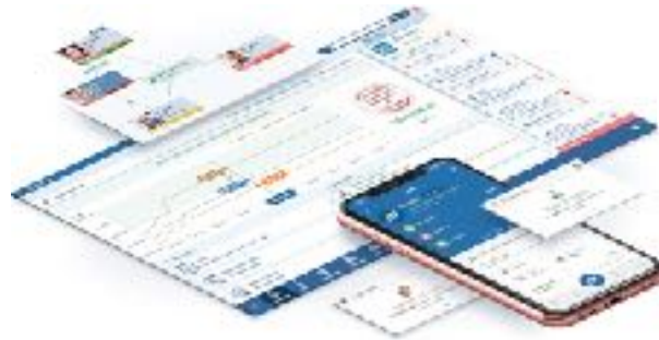
Sales Friendly Interfaces