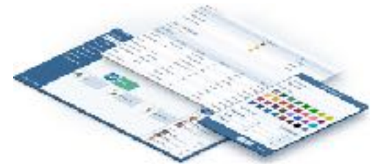
Automates & Integrates with Everything