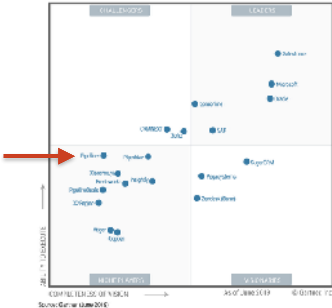
Figure 8. Magic Quadrant for Sales Process Automation