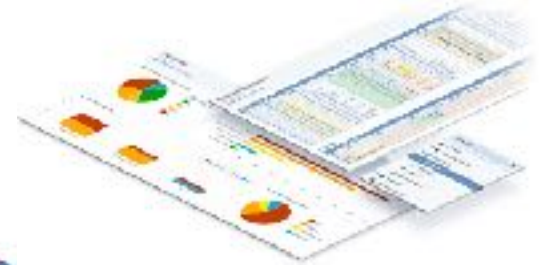
Instant, dynamic visualized reporting